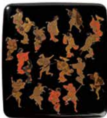
Above: as part of Asian Art in London, Sydney L. Moss, established in 1910, will be exhibiting Japanese lacquer inro and writing boxes, or sizerubako.

上图：成立于1910年的Sydney L. Moss，作为伦敦亚洲艺术的一员，将展出日本漆器印笼和笔筒盒。