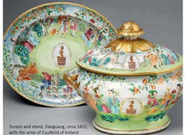
Tureen and stand, Daoguang, circa 1825, with the arms of Caulfeild of Ireland

PO Box 2435, Chippenham, Wiltshire SN14 7XN, England Mobile: +44 (0)7785 282290 www.heirloomandhoward.com Email: office@heirloomandhoward.com