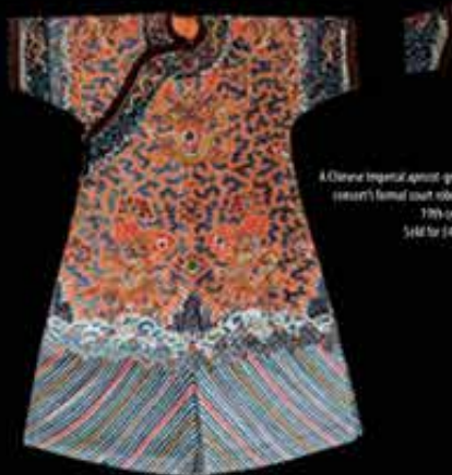
A Chinese imperial spirit gown, recent formal court robe, 18th century. Sold for £43,000