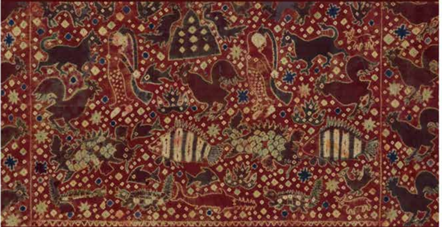
Pictorial Khmer Silk, Cambodia, early twentieth century, 79 x 158 cm